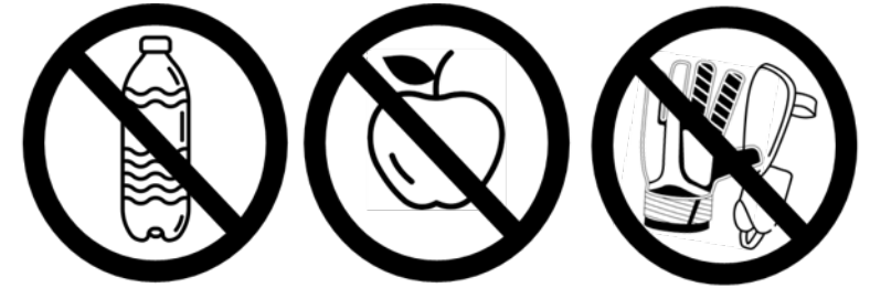
NO SHARING DRINKS, SNACKS or EQUIPMENT