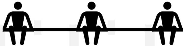
Social distancing on team bench